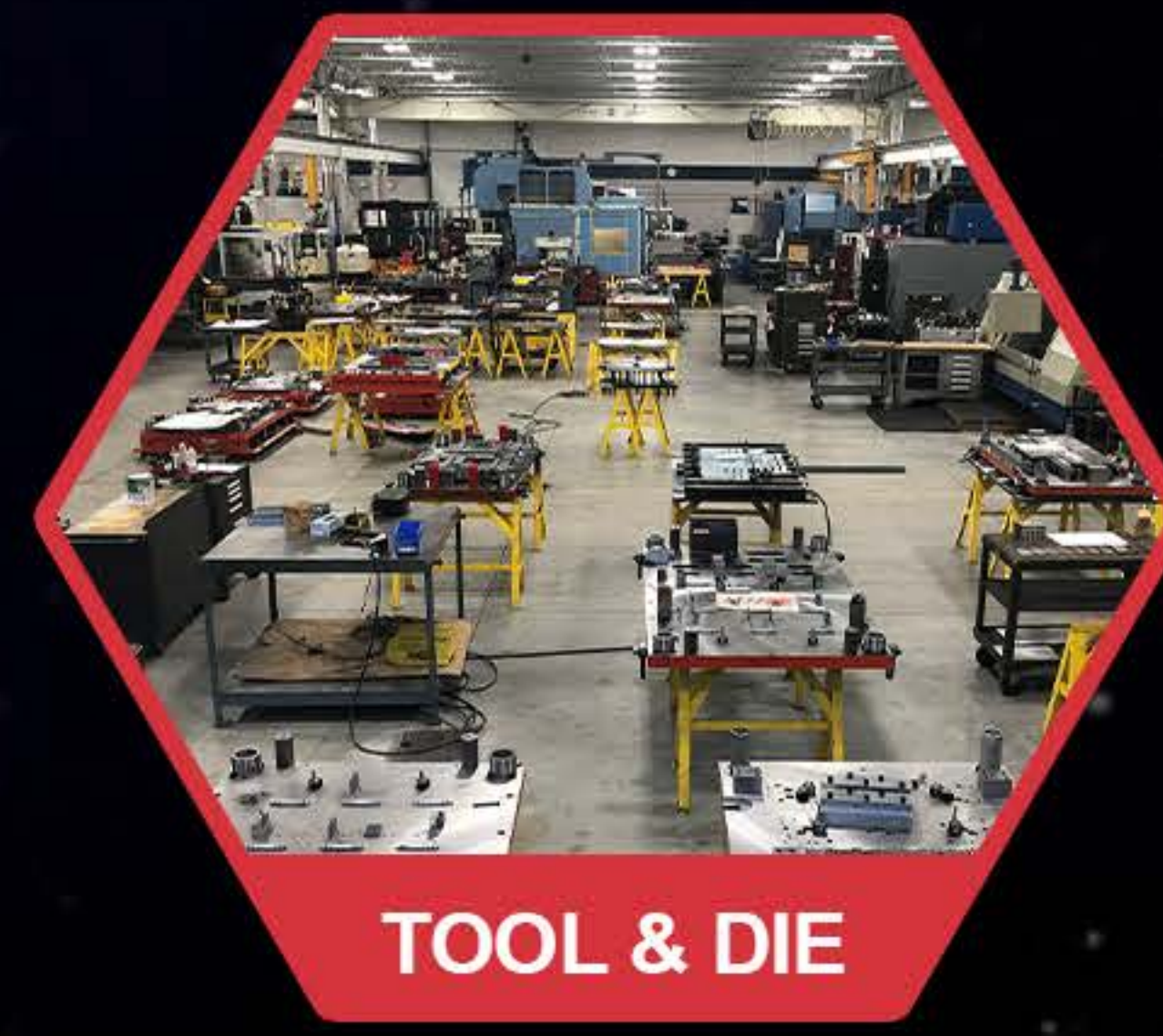
TOOL & DIE